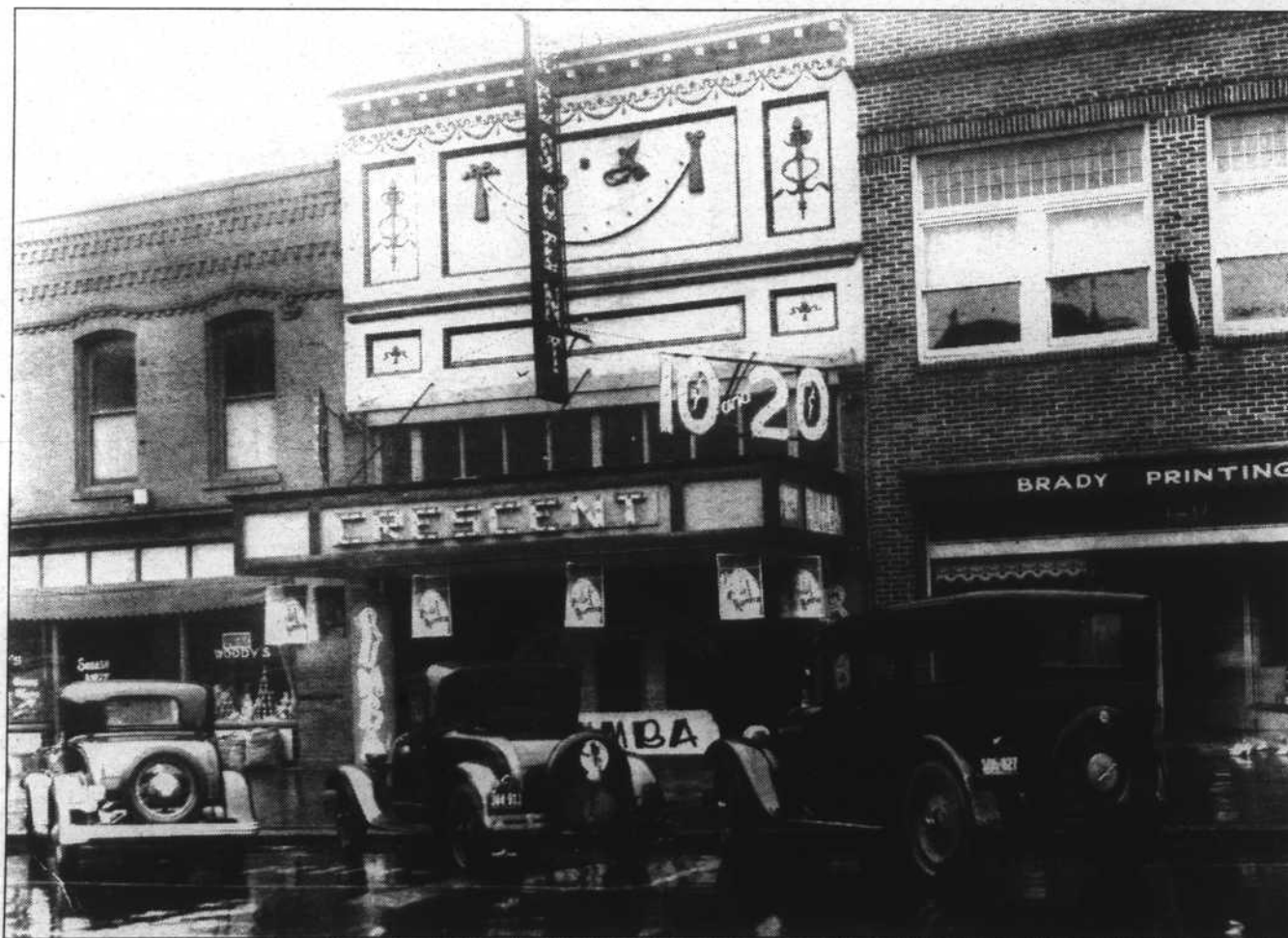
AT LEFT, THE CRESCENT THEATER STOOD, about two blocks up the street, on West Broad. There, if you were a kid, ten cents would buy you a ticket but the adults would have to shell out twenty cents to see cowboys like Tom Mix and Buck Jones apply their six-gun justice to the bad guys. Notice Brady Printing Company on the right and Woody's Grocery Store on the left. The picture was probably taken in the early 1930s.