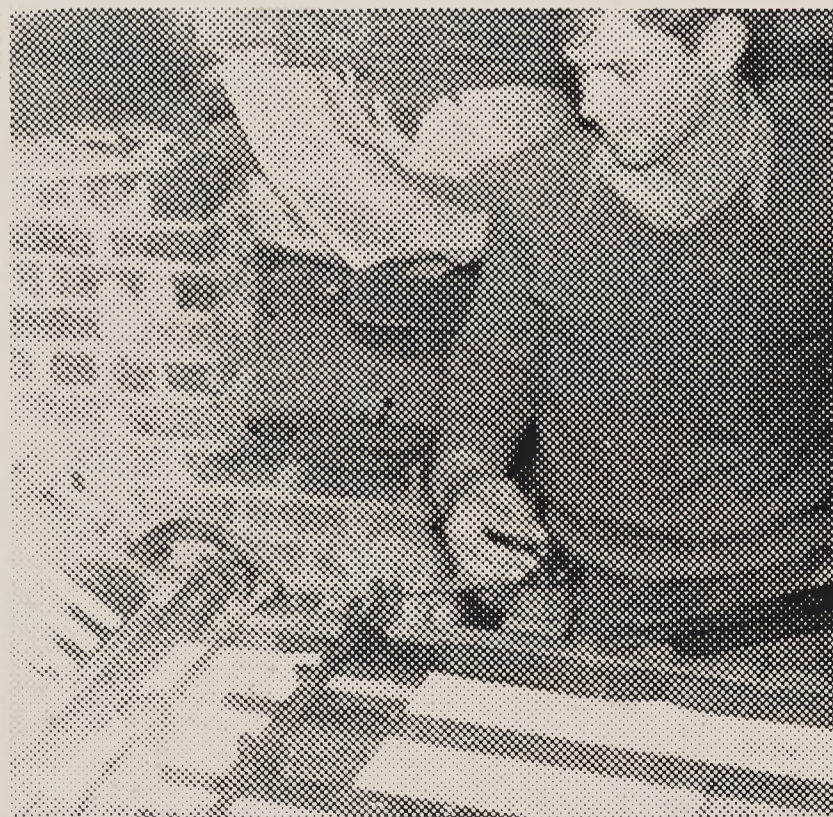
Thursday morning: The finished paper is folded by an electric folding machine which folds the entire edition of 400 copies in about five minutes.