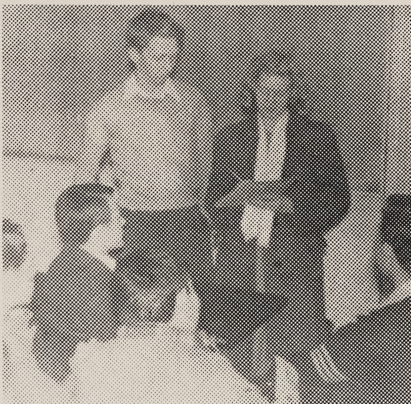
Wednesday morning: Staff meeting is held and assignments are made for the following week's issue. General staff business is also discussed.