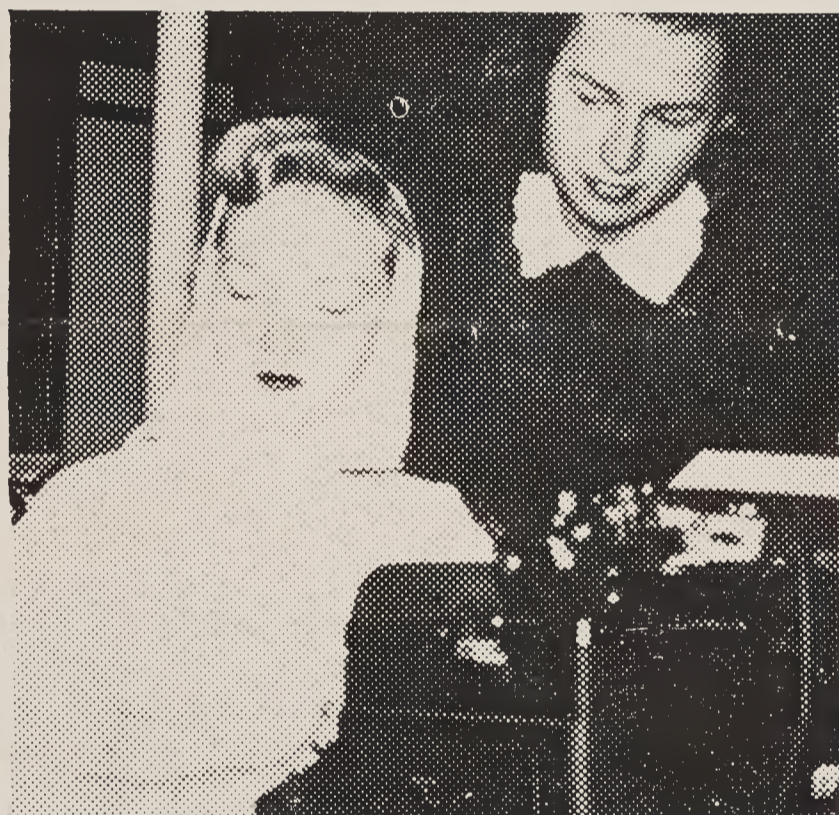
Saturday and Monday mornings: Typists decipher the work of the staff writers and recopy it before it starts its journey to the printshop.