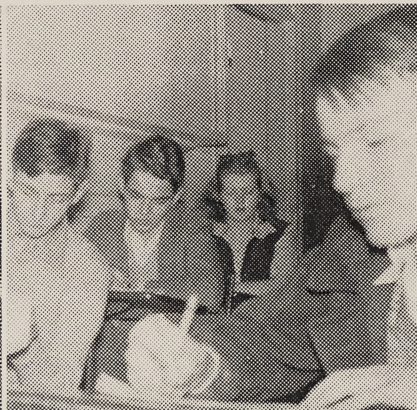
Thursday, Friday, and Saturday: Staff reporters and feature writers gather the week's news and put it down on paper. The content of the paper begins to shape up.