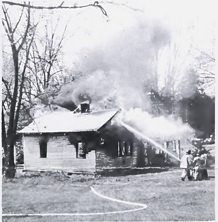
GONE TO BLAZES —Smoke from this burning house pollutes the air April 22—Earth Day—as Statesville firemen carry out a practice maneuver. The unused wooden structure on the west campus was reduced to ashes to make room for a warehouse, according to Mr. Dan Shoemaker of the college's maintenance staff.