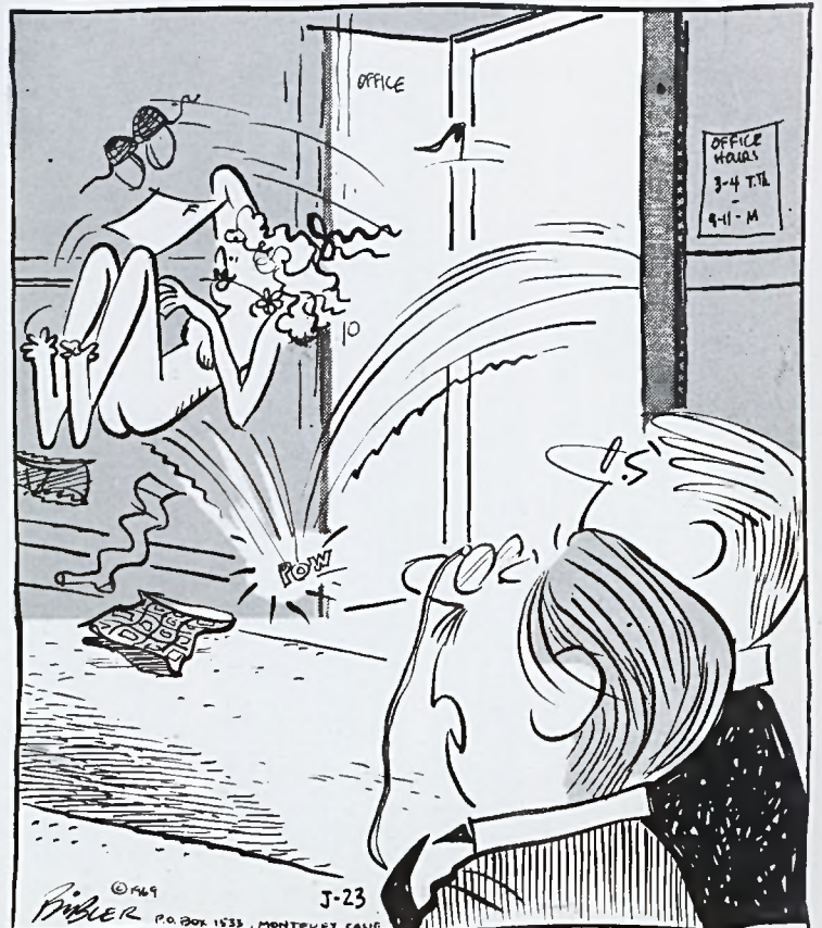
"I HATE THIS TIME OF THE YEAR WHEN THE STUDENTS START PRESSURING FACULTY TO CHANGE GRADES."