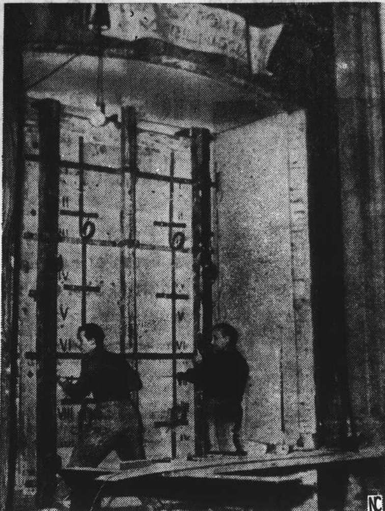
the heavy Holy Doors and making other preparations to loosen the walled-up door (right photo). When His Holiness on Christmas Eve struck the door for the third time with the golden hammer, workmen behind the door were able to wheel it away. The Holy Doors of the four basilicas will be walled up again at the close of the Holy Year.