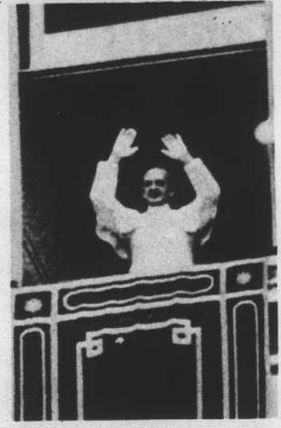
POPE PAUL VI bestows his blessing from a window of his study in the Apostolic Palace (Dec. 10) in Vatican City on a throng gathered in St. Peter's Square despite cold, rainy weather.