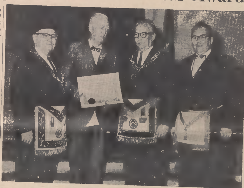
DIAMOND JUBILEE AWARD