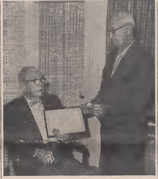
RECEIVES 60-YEAR AWARD

an earlier day. In 1970, we are not compelled, as were the Pilgrim Fathers, to brave the plar leader were held in El Paso, Texas, (Continued on Page Three)