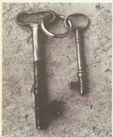
These keys open the oldest Masonic building in America. (See article on page five.)