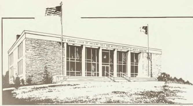
Official Publication of The Grand Lodge of Ancient, Free & Accepted Masons of North Carolina