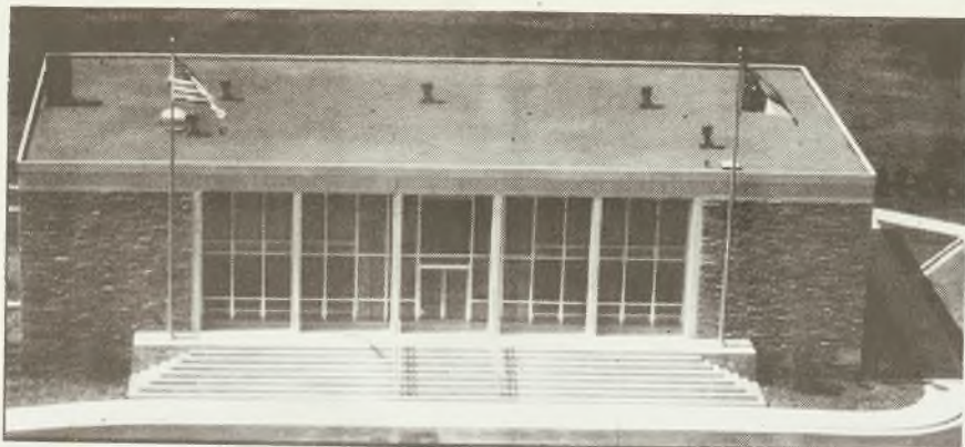
Official Publication of The Grand Lodge of Ancient, Free & Accepted Masons of North Carolina