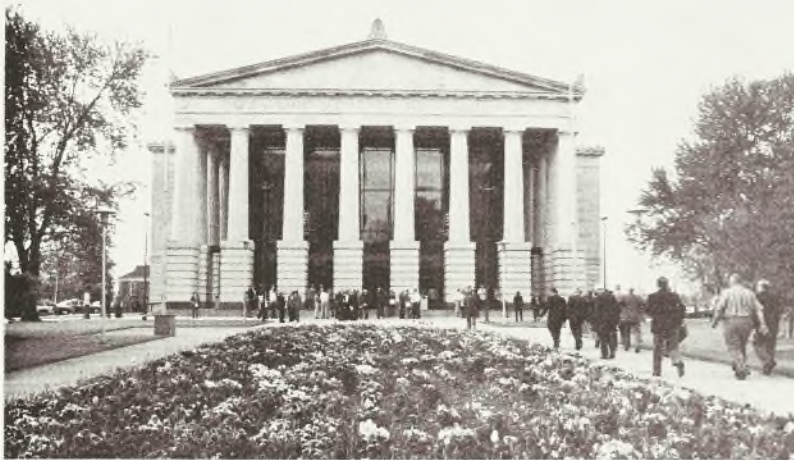
Masons from around North Carolina shared each other's company in the lobby and outside Memorial Auditorium in Raleigh during Annual Communication.