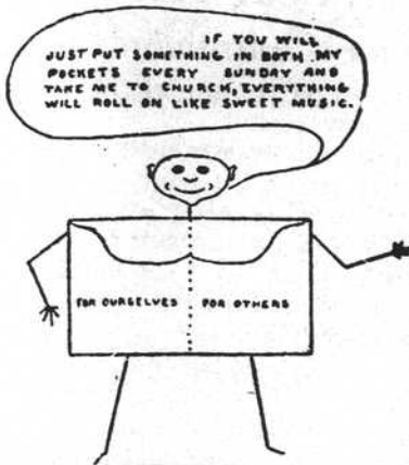
OUR LITTLE FRIEND DUPLEX.