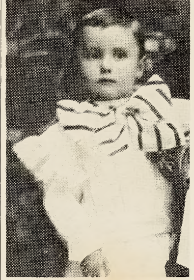
BABY OF THE MONTH

Well, school's out, and most of us are happy! "It isn't that we don't like school," some students say. "It's just the principle of the thing."