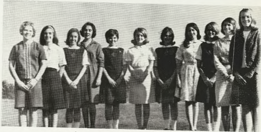
1966 HOMECOMING COURT