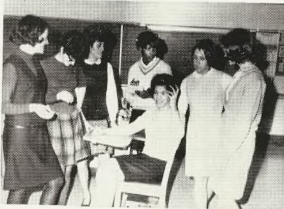
Drama Club members practice for their upcoming production, "Opening Night."

A contest to be held in the future will permit interested students to submit entries to be judged for a prize that will be awarded for the best song.