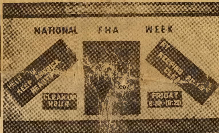
"An attractive 'Bulletin Board' display in the main hall emphasized FHA Week observance and announced the objection for sponsoring the clean-up campaign."

The Society wishes to thank those responsible for making this ceremony a nice one.