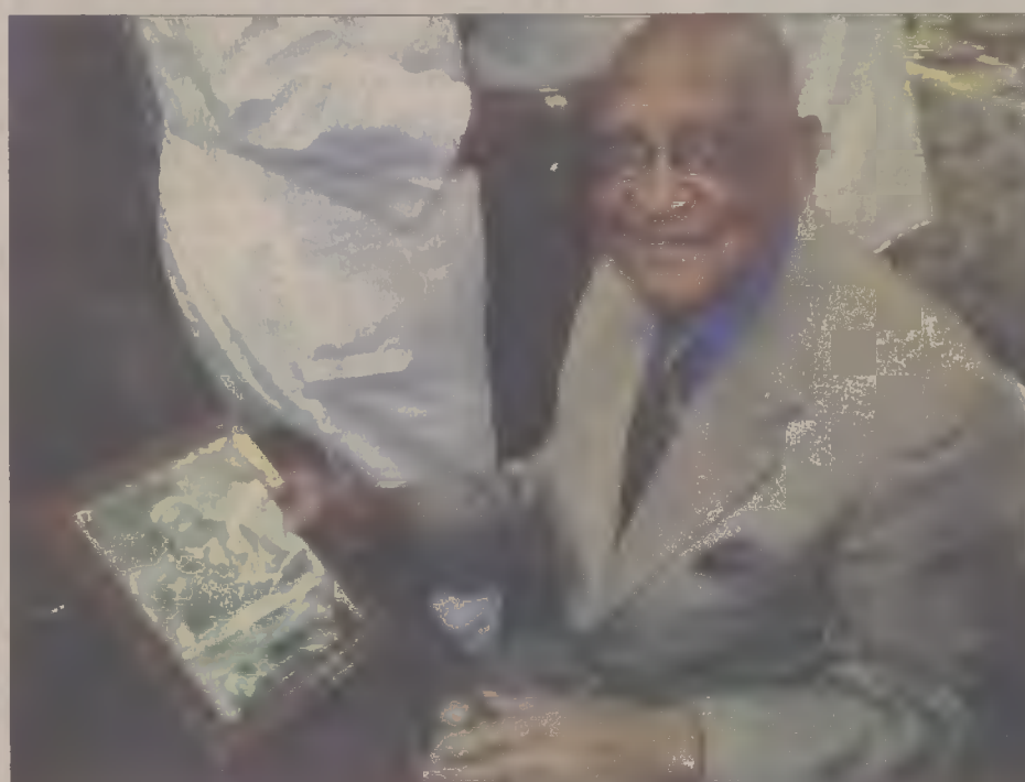
ROANOKE RIVER PARTNERS