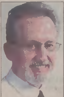
Contributing columnist Mark Rutledge explains why 'Fifty Shades of Gray' is a frustrating way to paint a house. Page A4