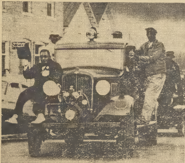
One of the Fire trucks which was in the Wake Forest Fall Festival parade on Friday afternoon, Oct. 24. This is the truck of Fire Department No. 2, colored. More than 4,000 people saw the colorful parade that was sponsored by the Chamber of Commerce.