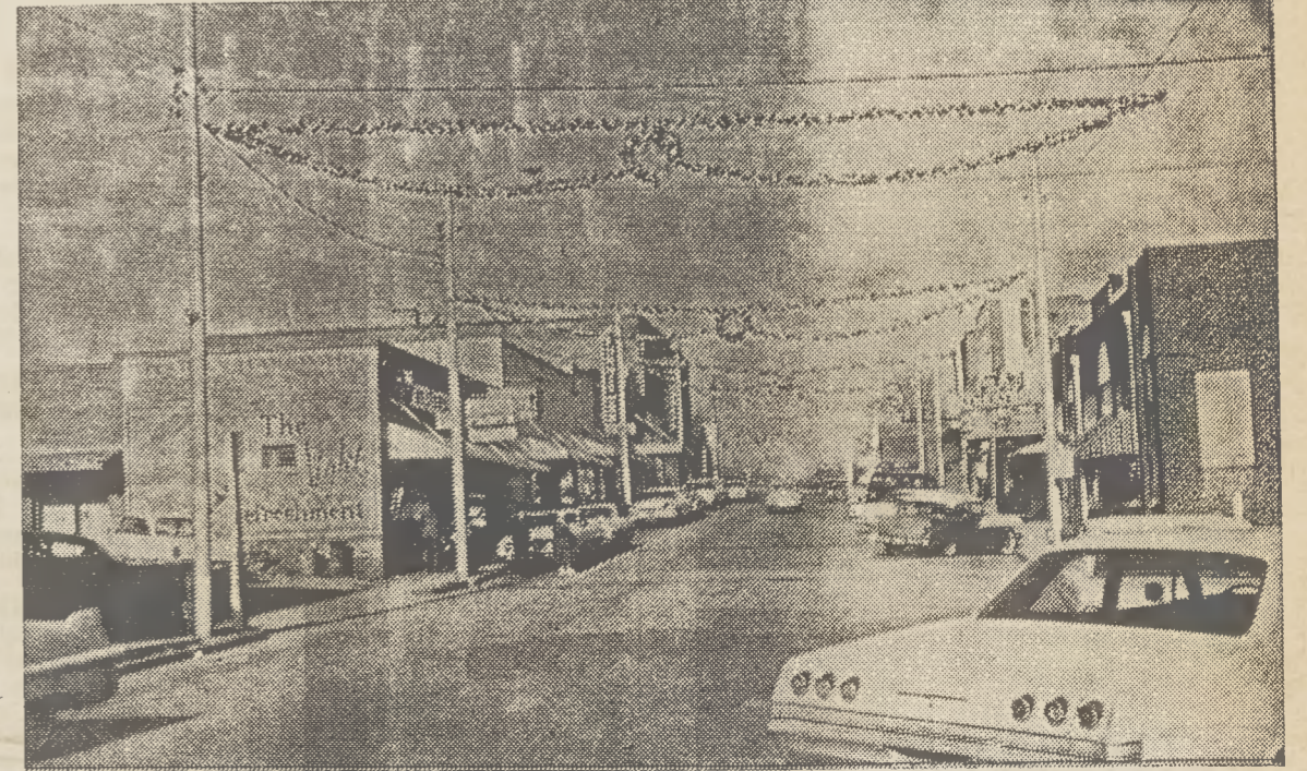
Wake Forest All Decked Out for Christmas