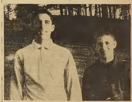
Golfing Brothers