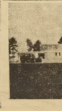
Vaiden Whitley Consolidated High School

Youngsville Elementary School observed Negro History Week, February 15-19. On Friday, February 19, the program was climaxed with an assembly program centered in the following areas: Grade 1 — The Negro in Religion, Grade 2 — The Negro in Sports, Grade 3 — The Negro in Art, Grade 4, Negro Jazz Music, Grades 5-6, The Negro in History, Grade 7 — Negro Folk Music, Grade 8 — The Negro in Politics.