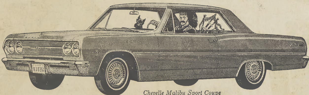
Chevelle Malibu Sport Coupe

No matter how you look at it, this car makes a lot of sense.