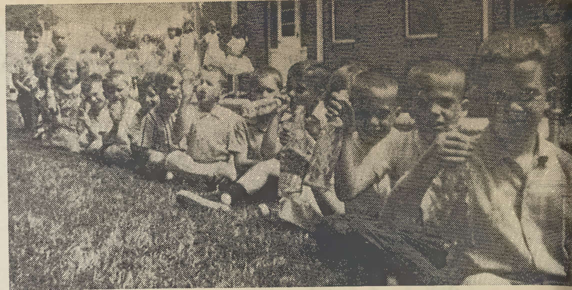
Refreshment time at Rolesville Vacation Bible School. The school, which opened Monday, has a record enrollment of 221 Tuesday. See story on page 4.

Call 556-3133 for Free Delivery and Phone Order Service South Brooks Street Behind Ford Motor Co.-Wake Forest, N. C.