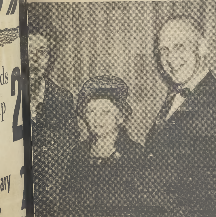
Society Honors Two

The streets in front of Miller Oil Co. and Keith's Market finally get paving to replace dust and mud.