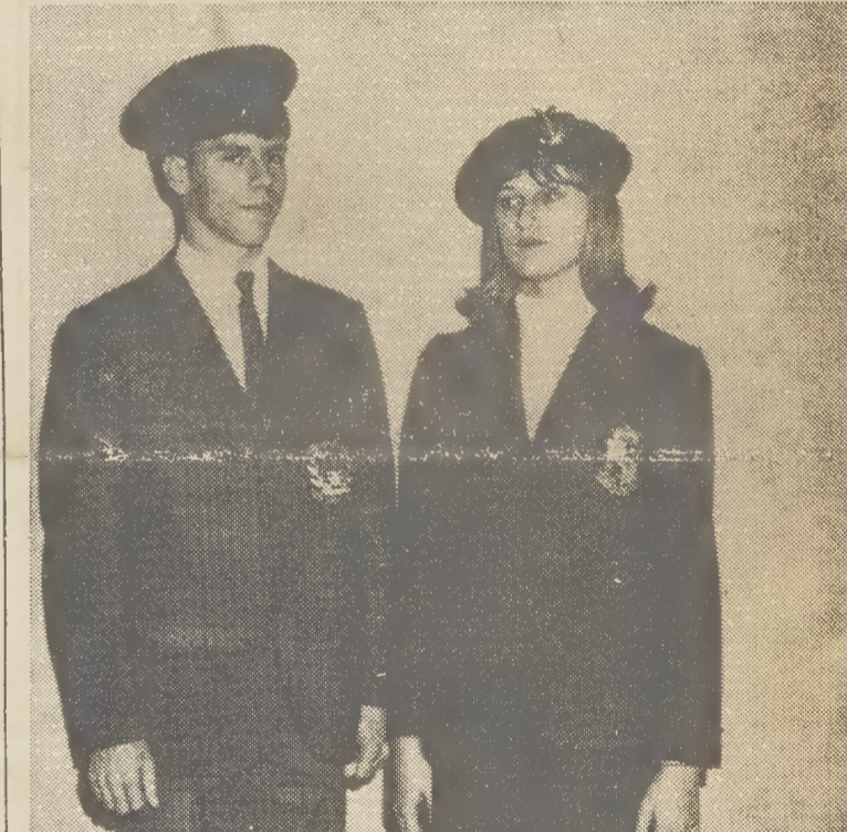
Blazers and Berets

It is a family affair and everyone, especially newcomers, is cordially invited to attend.