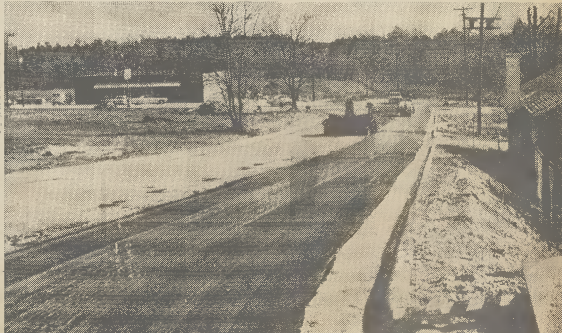
Brooks and Elm Get Paved

The Senior band marched in the Raleigh Christmas Parade Monday, and both the Junior and Senior bands will take part in the Wake Forest Parade on Dec. 10.