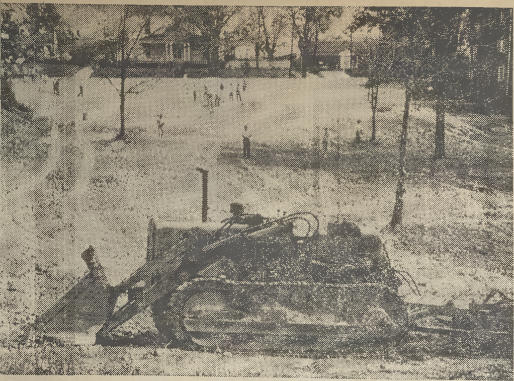
Ag Boys Rake, Seed Holding Lot