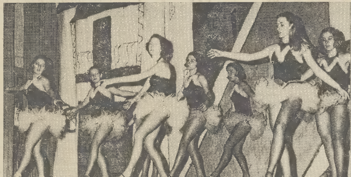
Students of Holding School of Dance participated in the Wake Forest Band Variety Show last week. Some of the ballet dancers were (l to r)