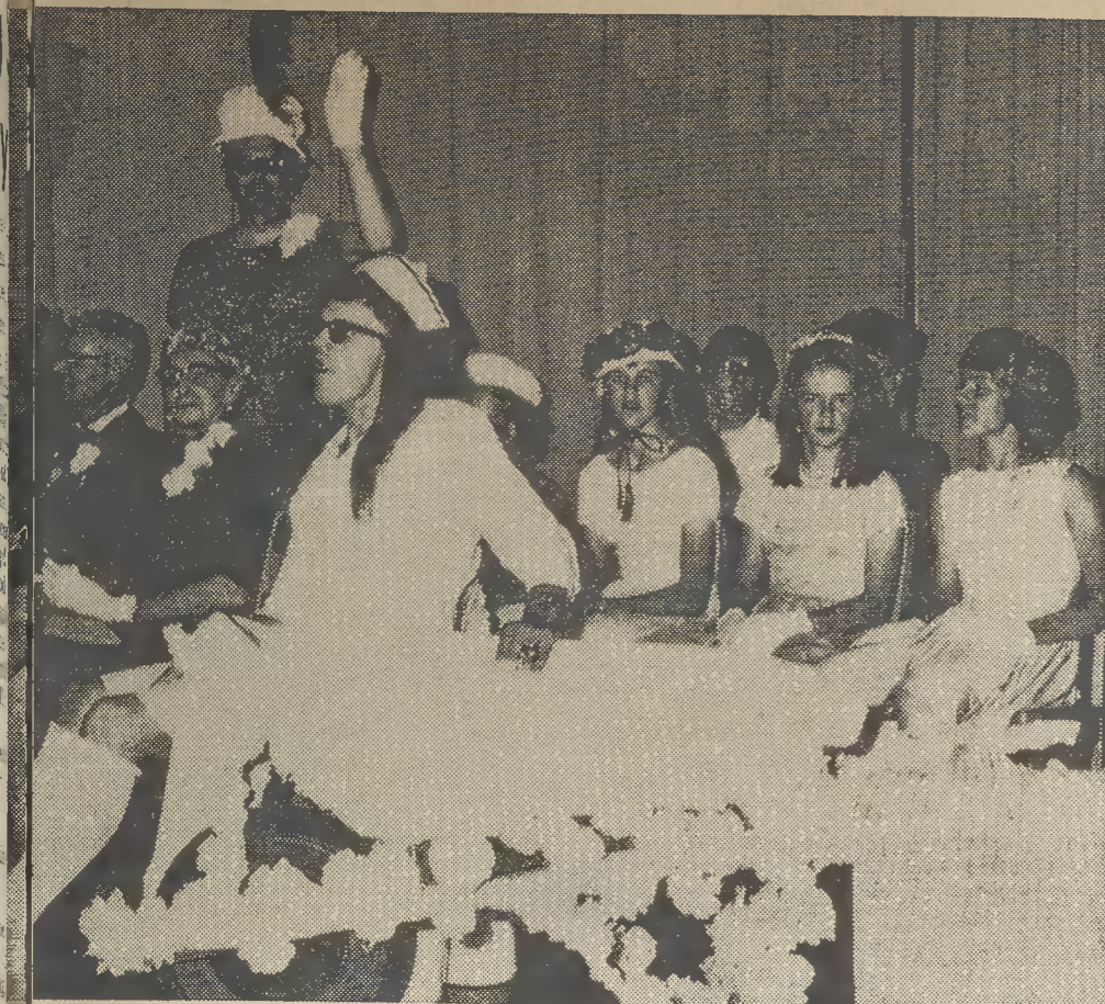
Womanless Wedding Guests

Volume XXI, Number 17 Published at Wake Forest, North Carolina 27587 Thursday Morning, April 27, 1967 8 pages this week 10c Per Copy