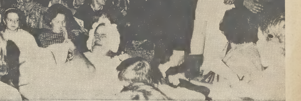
It Took A Wheelbarrow for This "Baby"