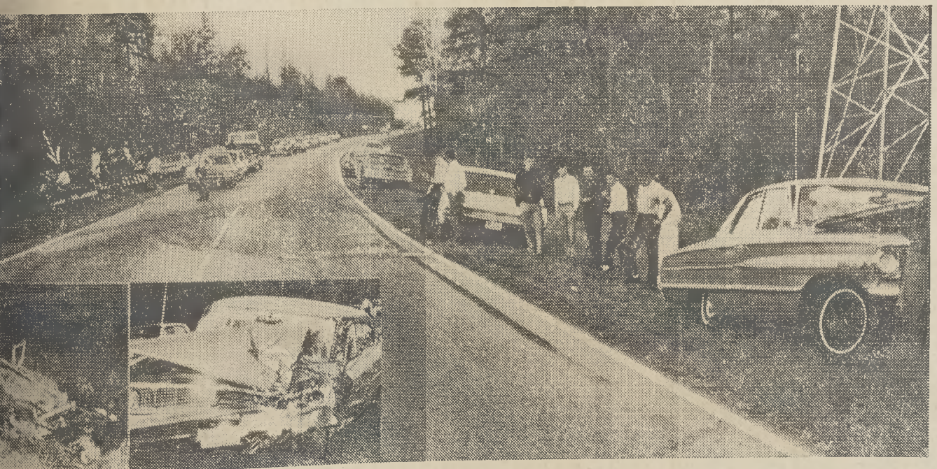
looking north on U. S. Hwy. 1 showing skid marks (row) before ending up on left side, Ford (right) has just been hoisted by wrecker. Inset shows truck front (left) and car (right)

Youngsville meets Bunn at Bunn, December 5.