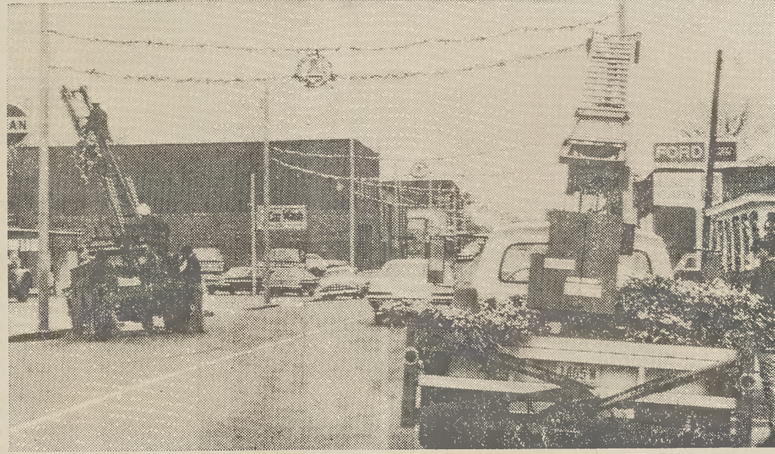
Town employees are shown putting the finishing touches to the Christmas decorations along S. White Street Monday. The multi-color lights will be turned on for the Friday Christmas parade which ushers in the holiday season. The town also decorates a beautiful tree on the seminary campus across from the underpass besides the water tank on Elm Street.

Four high school bands, ten professional floats, plus many school entries and lovely young ladies will help usher Santa Claus into Wake Forest Friday afternoon at 4 p.m.