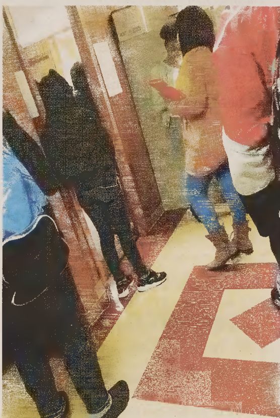
Students say registration was smoother this semester

The process did not go smoothly for everyone, and there were still com-