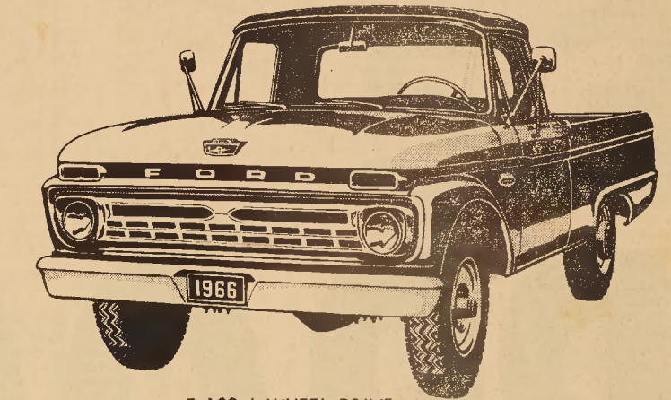
F-100 4-WHEEL DRIVE