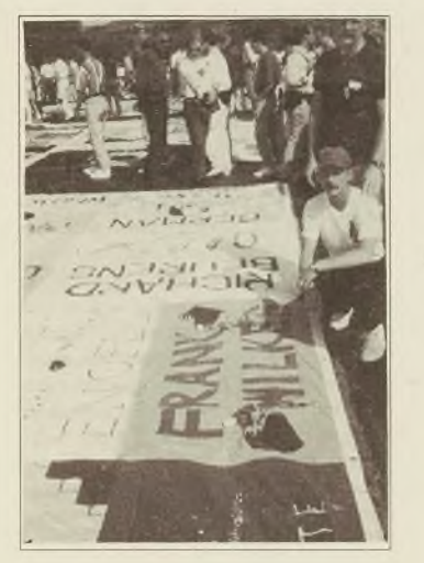
The Quilt