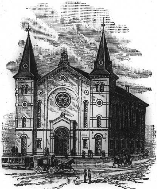
COLUMBUS AVE. A. M. E. ZION CHURCH.