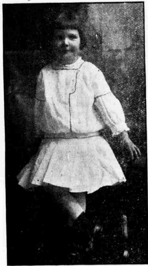
One of Our Girls.