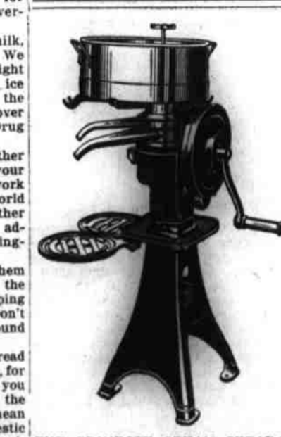
THE PRIMROSE CREAM SEPARATOR.