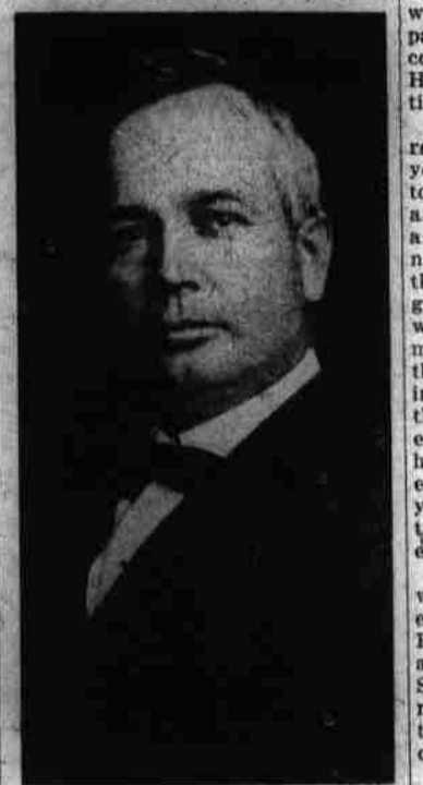
HON. T. W. BICKETT.

Democracy's State Leader Will Speak on Ford Field to Great Outdoor Gathering of Folks.