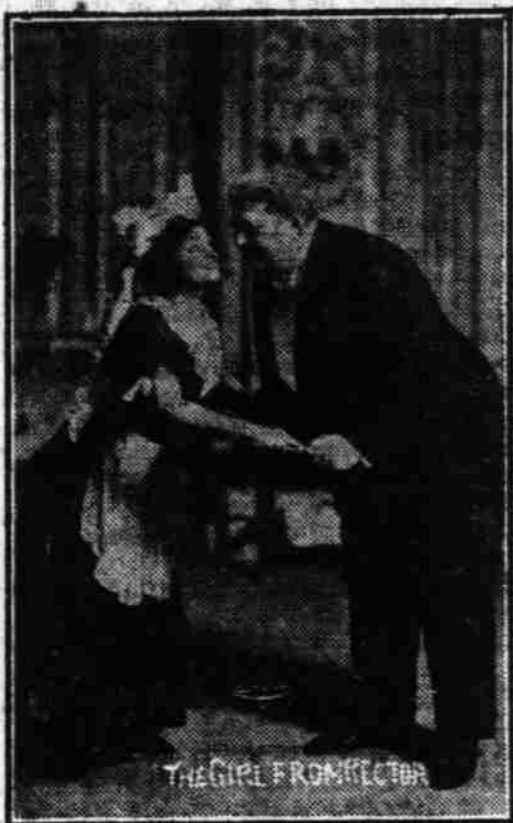
THE GIRL FROM RECTOR'S

The story of the play, briefly, is this: Loute Sedaine is "The Girl from Rector's," a merry, dancing, dashing little slip of humanity.