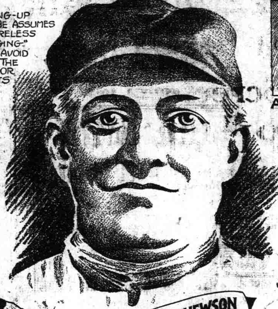
CHRISTY MATHEWSON Star Pitcher of the N.Y. Giants

WHEN WARMING-UP FOR A GAME HE ASSUMES AN EASY CARELESS "GATE-SWINGING" ATTITUDE TO AVOID STRAINING THE MUSCLES OR LIGAMENTS