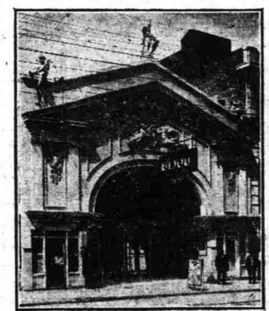
Alice Joyce, in "The Christian." "The Accidental Bandit"—Comic. "Two Too Many"—Comic. We Lead, Others Follow, at the

Buy a Book of Grand Theatre Tickets—12 for 50c. You Save 20 Per Cent.