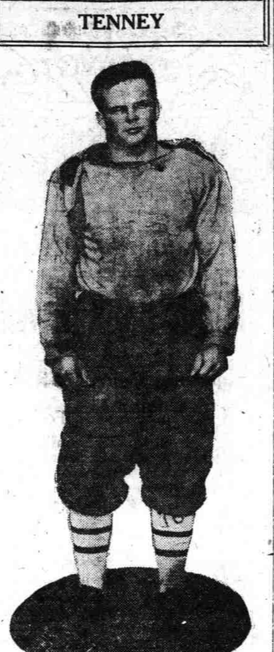
A. & M. Team's Full Back in Thanksgiving Game With Washington & Lee.

but willingness has been expressed by some of them to assist Yale and Princeton to lighten the end of their football schedules.