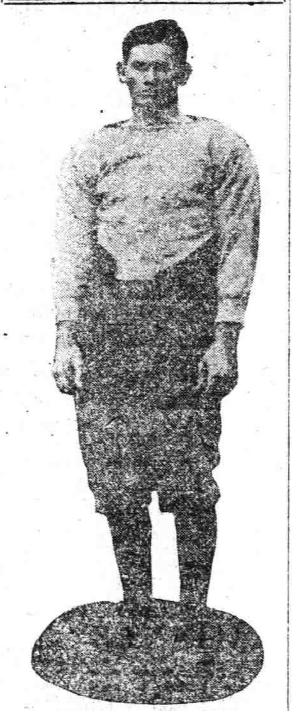
A. & M. Team's Right Half Back in Thanksgiving Game With Washington & Lee.