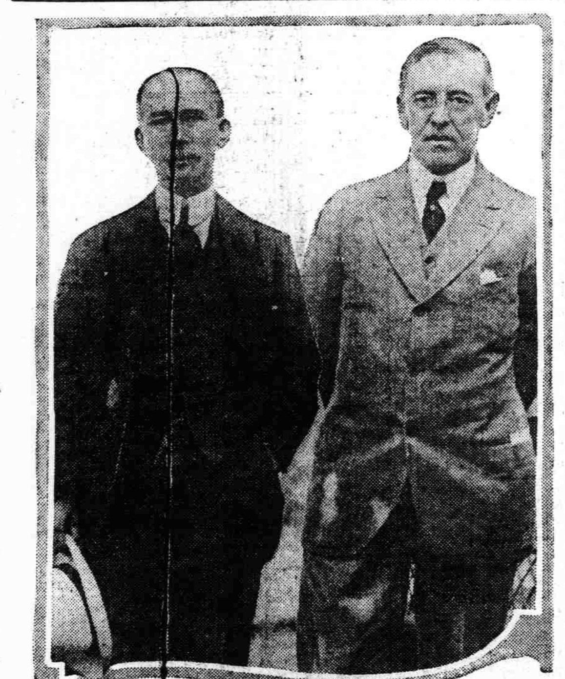
President Wilson paid a visit to Col. E. M. House, his close friend and unofficial envoy to Europe, at the latter's home at Roslyn, L. I., a few days ago. Colonel House has just returned from abroad and the President's visit was for the purpose of hearing the Colonel's report on conditions there. The President was in fine spirits and consented to pose with Colonel House for the photographer.