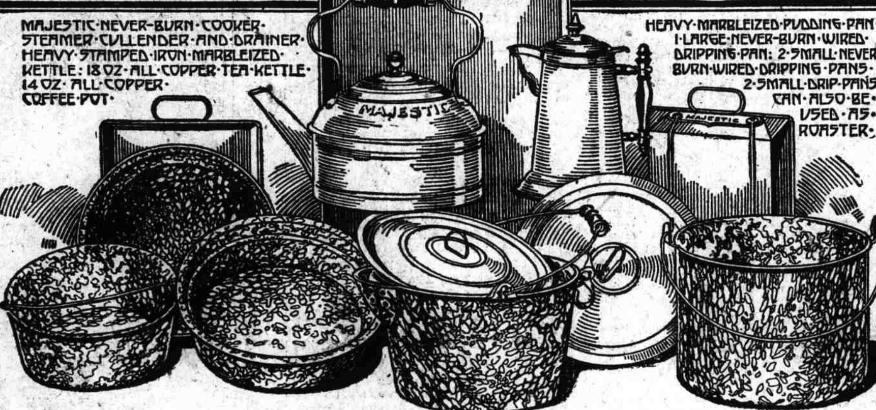
THIS SET OF WARE FREE