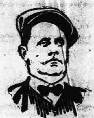
"Nothing suits my taste like Tuxedo. 'Can't find anything as good as Tux."