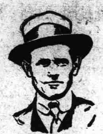
"Tuxedo has the best flavor and gives me the sweetest smoke of any tobacco. I see the boys smoking it all along the line."