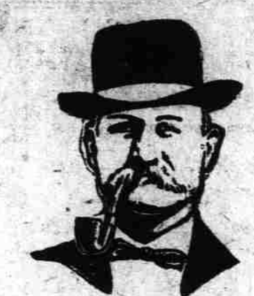
"The last thing I do before taking my engine out is to smoke up hard on my pipe of Tuxedo. No other tobacco stays by me like