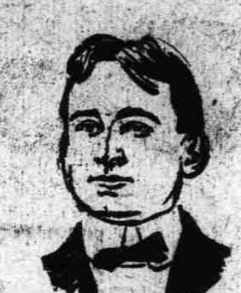
'The best thing about Tuxedo is that I can smole it all day and enjoy it every minute." C. H. SLAYDAN