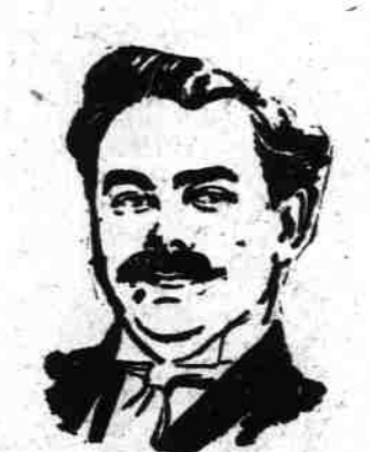
'When I jump off my engine the first thing I reach for is my pipe and tin of Tuxedo. I smoked it years ago and have gone back to it-same as most everybody