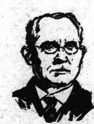
"No other tobacco hits th