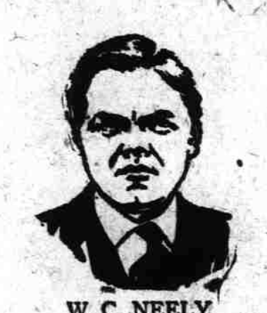
"I smoked Tuxedo a long time ago and now I'm smoking it again. None of the others can hold a candle to it." W. C. NEELY