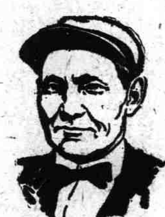
"An engineer's job is no joke, and he needs a tobacco that's got some hustle to it. I've tried em all and gone back to my first love-Tuxedo. There's nothing