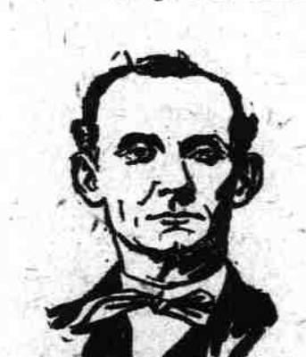
"I have tried Tuxedo and find it so good that I use it all the