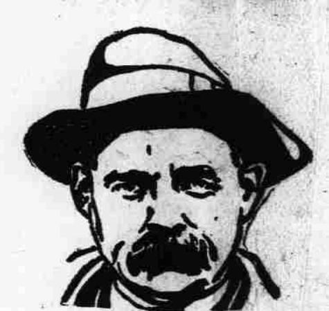
"Tuxedo is the standard gauge amoking tobacco of the world in my judgment. They've kept making it better and better until it's left all other brands miles down the track."