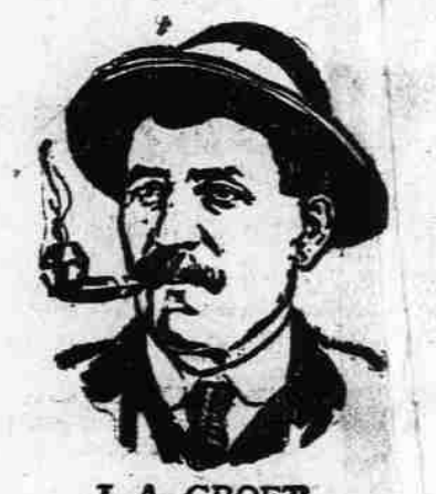
There's something about the delicious flavor of Tuxedo I can't find in any other tobacco and I've tried them all."