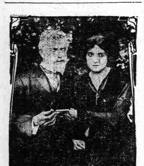
"THE UNFAITHFUL WIFE" W.F.O. FOX PRODUCTION Starring Genevieve Hamper and Robert Mantell, Royal today.

Vivian Rich was born at sea—something of the restless mystery of the ocean, with the changing mood of the winds and sky, seem to have become a living part of her nature. Swimming, riding, playing tennis and reading, not to say writing letters to her thousands of admirers are among her hobbies.