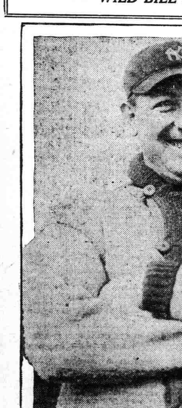
Yankee Manager, Whose Team is Proving a Disappointment.