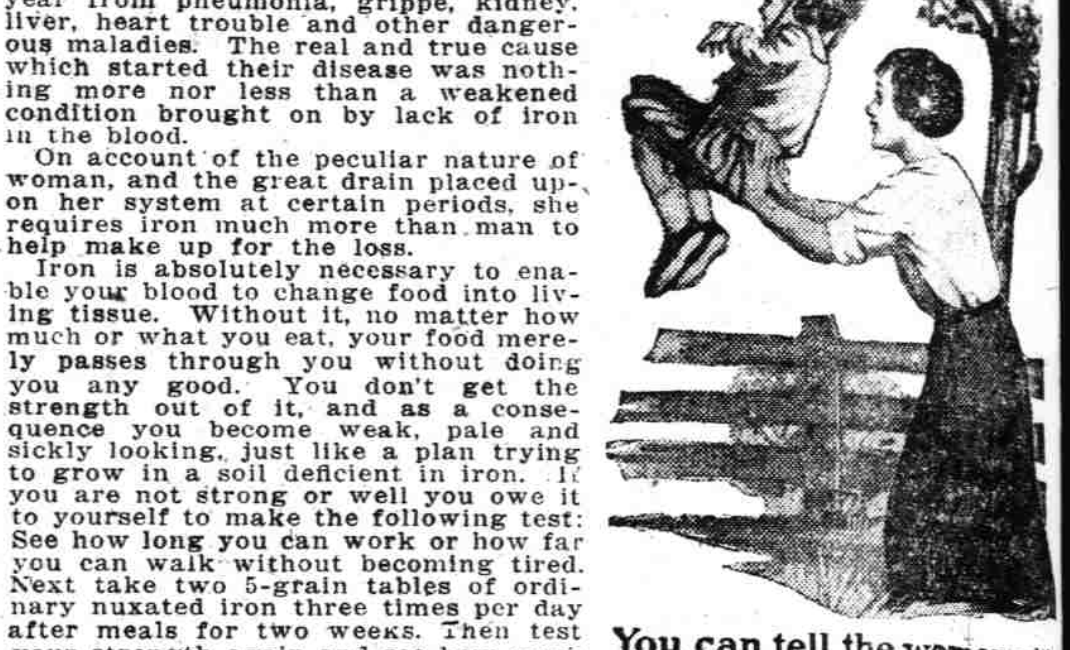
You can tell the women with plenty of iron in their blood beautiful healthy rosy cheeked women full of Life, Vim and

surprising reports in regard to its 'Many an athlete and prize has won the day simply because knew the secret of great strengt endurance and filled his blood rious defeat simply for lack o of St. Elizabeth's hospita given out any medical informat advice for publication as I order ness, nervous irritability, melanindigestion, flabby, sagging mu etc., and in consequence of their ned run down condition they are diseases that I deem it my duty vise such to taxe Nuxated from taken it myself and given it to