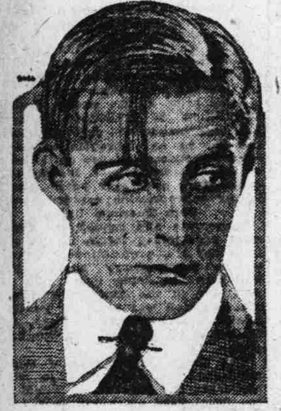
O. Henry story, "You're Fired," at the Grand today.

Grand "You're Fired!" a new Paramount roy morning. picture which comes to the Grand theatre today, expresses himself as being delighted with this opportunity