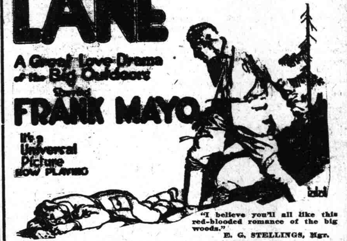
"I believe you'll all like this red-blooded romance of the big woods." E. G. STELLINGS, Mgr.

Sunset on the pine-clad hills. The ripple of falling waters and the soft words of man and maid stealing across the mirror surface of a mountain lake. It is Arcadia, the cradle of Romance. Go to this Nature-kissed land, with "The Red Lane."