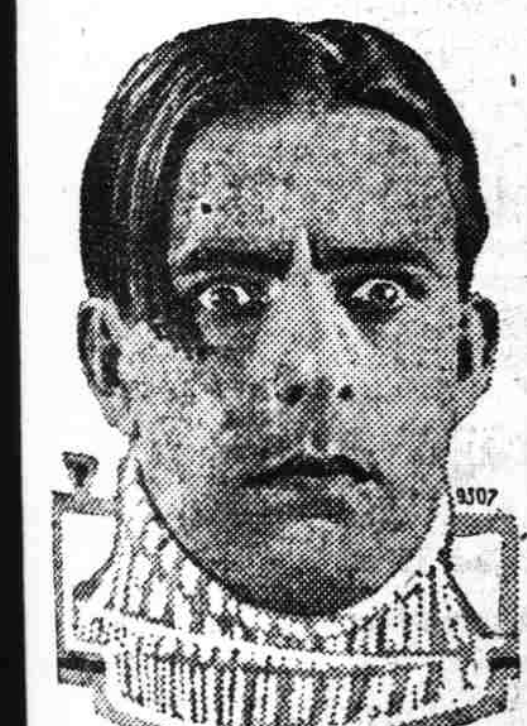
WALLACE REID "The Lottery Man" A Paramount Artcraft Picture Opening a two-day engagement at the Grand starting today