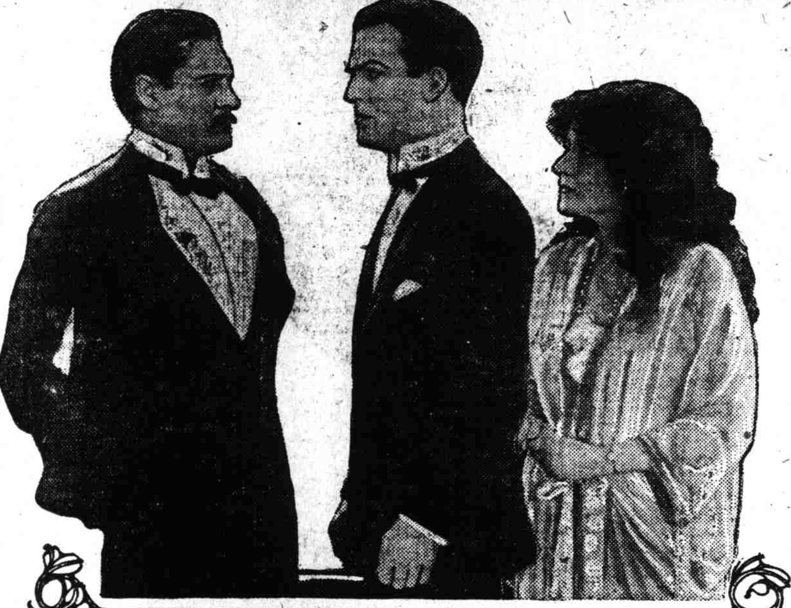
Lionel Barrymore in "The Master Mind"

A First National attraction opening at the Royal today