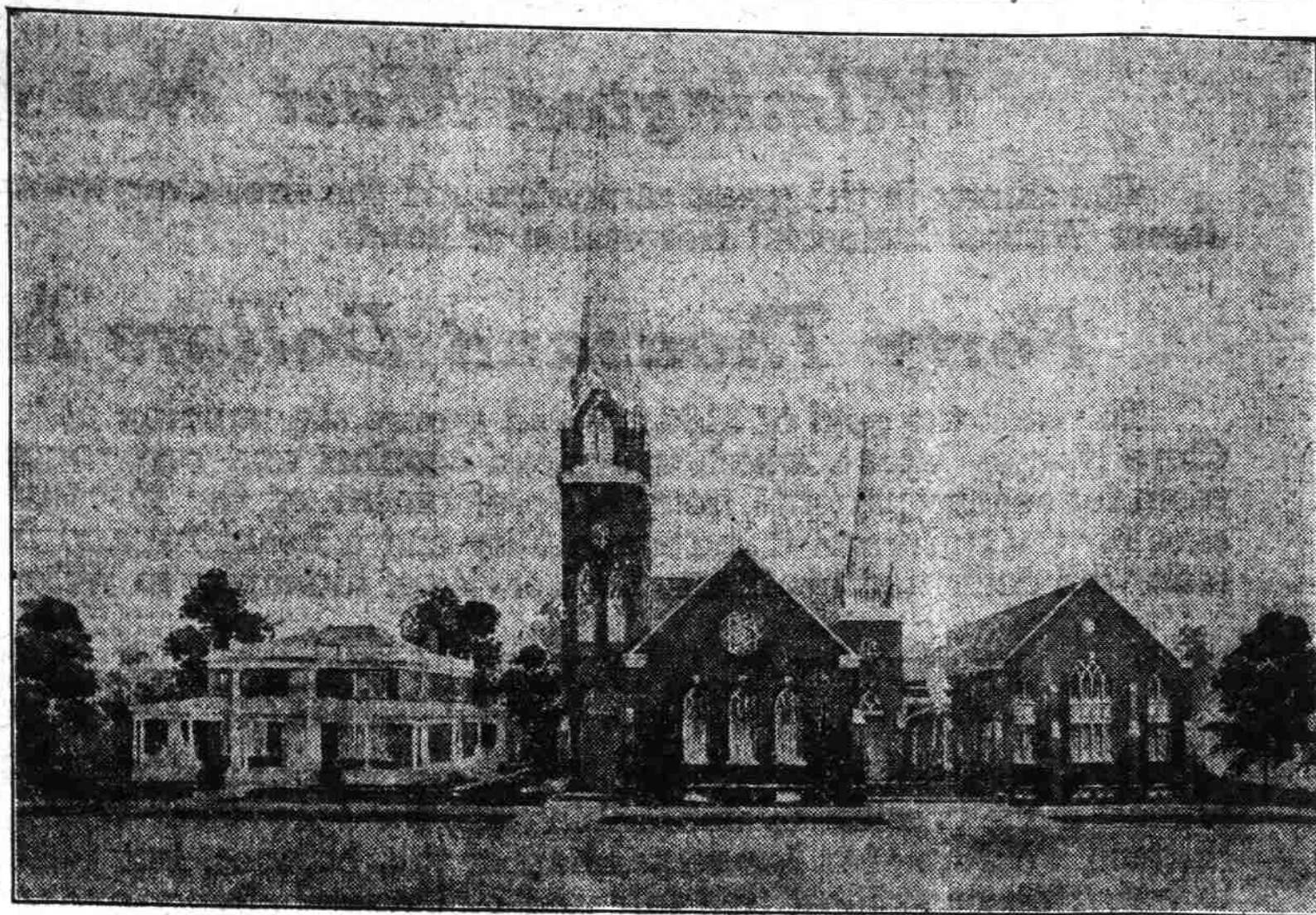
The picture shows the parsonage, church building and new Sunday school structure of the Fifth Avenue Methodist Episcopal church, as the entire plant will appear when the Sunday school building is completed.

for 750 people, and capable of being thrown together with other rooms, thereby greatly enlarging its capacity. The building will be entered through an open cloister, and immediately on the right of the cloister will be a large combination club room and library. It is expected that a library of not less than 5,000 volumes will be available for the use of the public shortly after the completion of the building. This will be an added advantage and a rather unusual feature for church buildings. The library will be in charge of the church secretary. The first floor will also contain the church office, and a number of class rooms. The second floor will be devoted exclusively to class rooms and galleries looking down into the assembly hall.