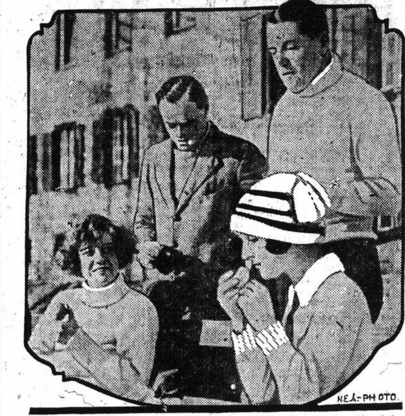
Society from all parts of the world has gathered to enjoy the winter sports at this famous resort. In the first row, left to right, are Lady Birkenhead and Miss Dunn. Standing, the Duke of Sutherland and Lord Birkenhead.